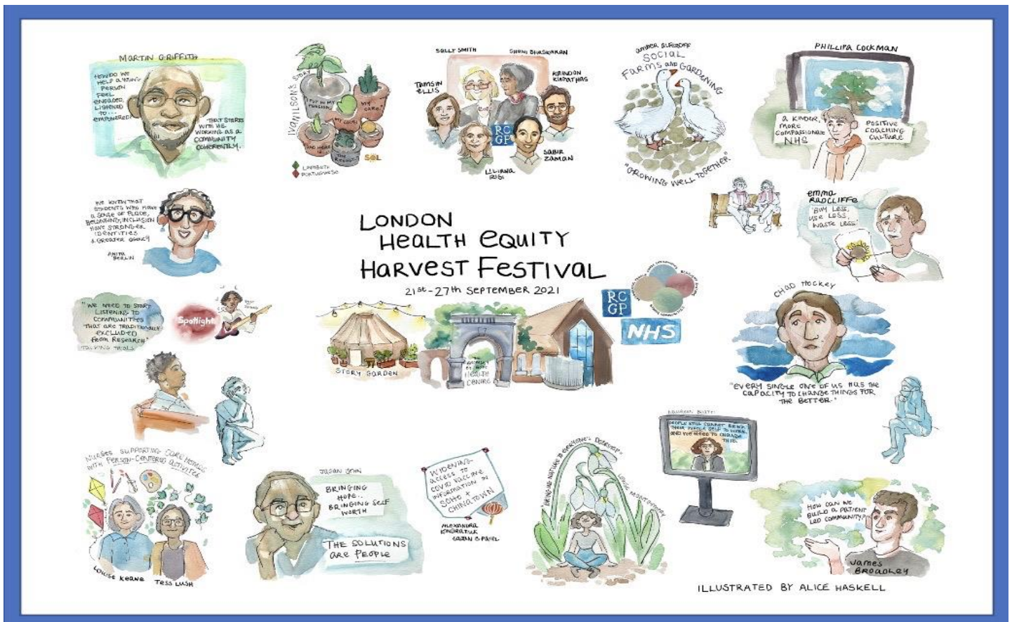
Figure1: Key messages of change captured by animation artist Alice Haskell